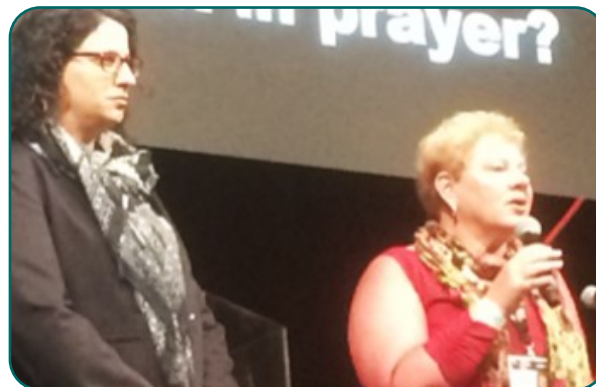
Above: Women of Distinction Tour at Spring Harvest. - See Page 2

May the resources we offer Him enable this vision to become a reality.