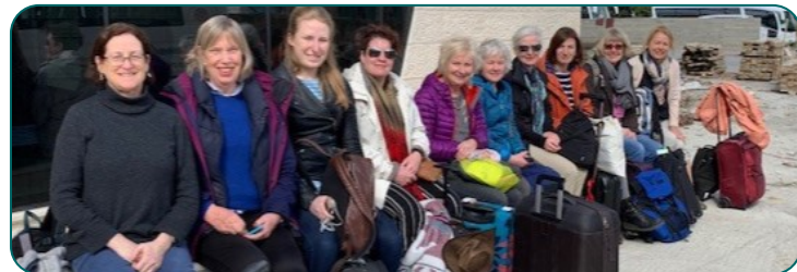
Ten women from N Wales - See Women of Reconciliation Page 3